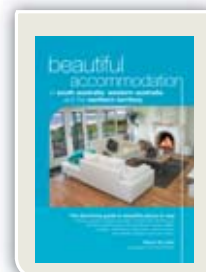
south australia, western australia and the northern territory

The Beautiful Accommodation guidebooks feature an exclusive collection of over 600 handpicked, visited, reviewed and photographed properties from all over Australia. Available for purchase at bookshops, selected newsagents, RACV, NRMA, RACQ and other RA outlets stores or via the website: http://www.beautifulaccommodation.com .