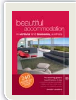
victoria and tasmania