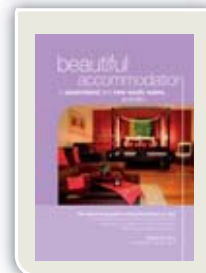
queensland and new south wales